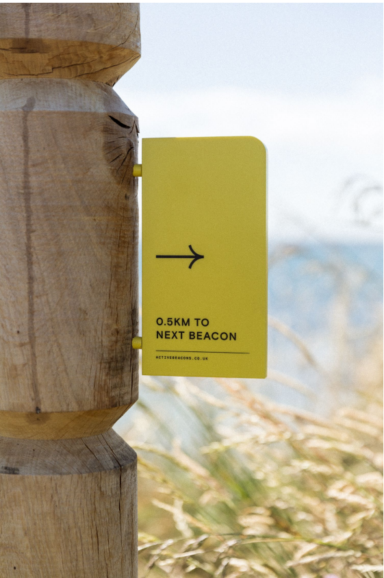
Gallery of Beacons — Coastal monitoring / user engagement / signage + QR