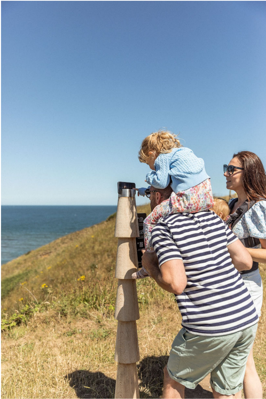
Photo Posts with stainless steel phone cradle for fixed point aggregate photography developed in partnership with East Riding of Yorkshire Council and the University of Hull. Installed as part of strategic investment in 'BlueHealth' resources and infrastructure which promotes well being through effectively managed and accessible 'blue spaces.'