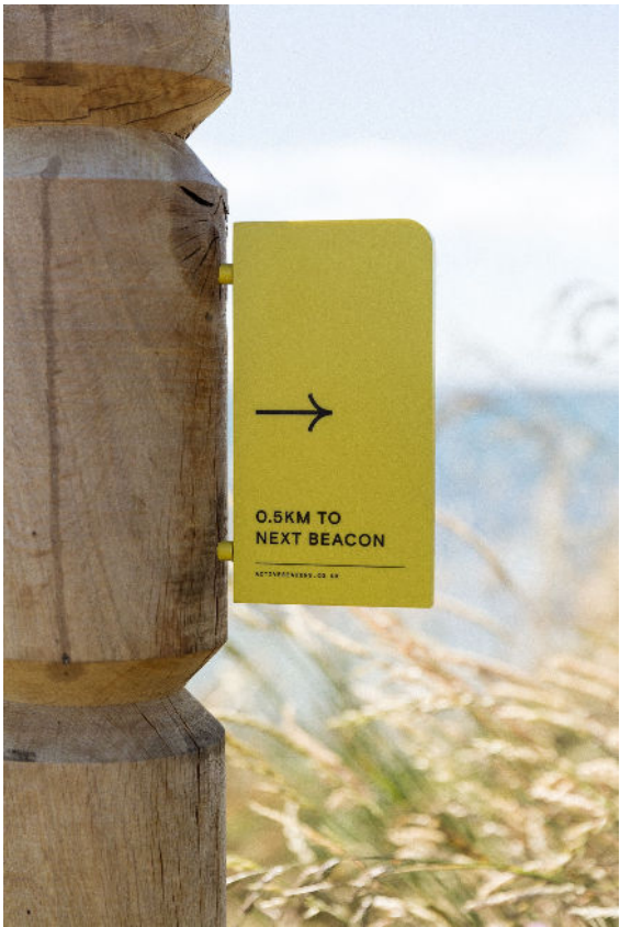
Gallery of Beacons — Coastal monitoring / user engagement / signage + QR