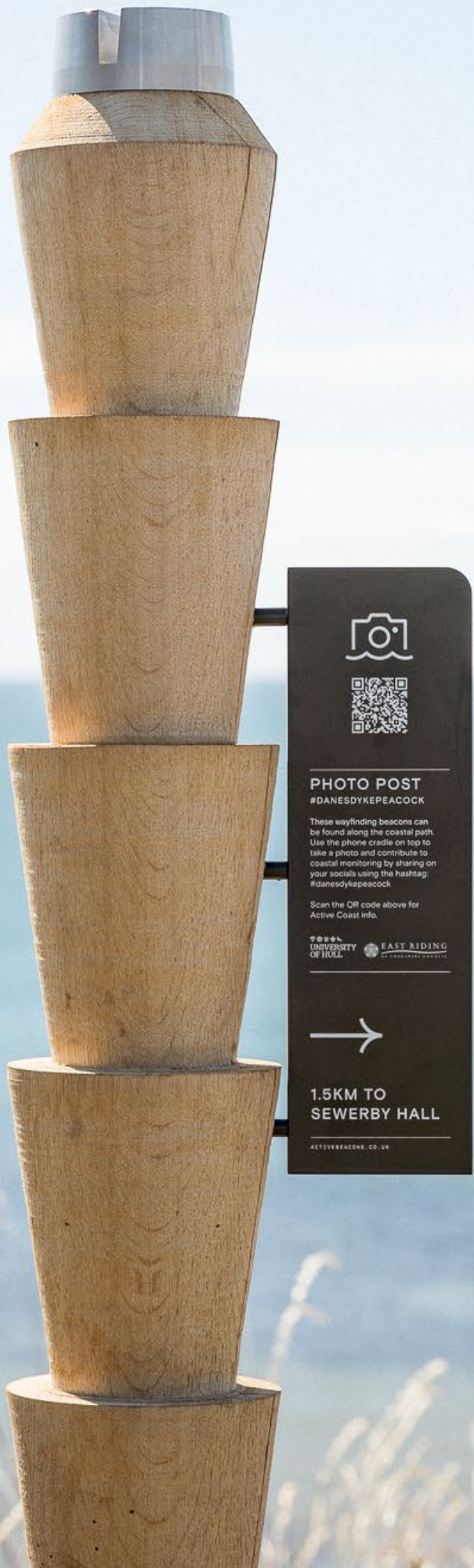
Beacon Detail — Danes Dyke, Bridlington, East Yorkshire

*Blue Health Installed on the Yorkshire Coastal Path as part of strategic investment in resources and infrastructure which promote well being through effectively managed and accessible 'blue spaces.'